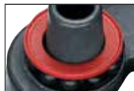
Put on red plastic washer so lip is up.