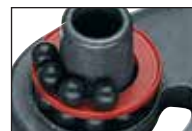
Put 11 Delrin® balls in next race.