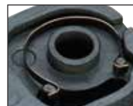
Hook each end of torsion spring around posts.