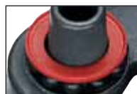
Put on red plastic washer so lip is up.