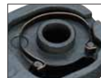
Hook each end of torsion spring around posts.