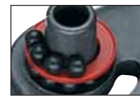
Put 11 Delrin® balls in next race.

Tip: Use two springs on each side to stiffen cam action or to act as a backup if first spring breaks.